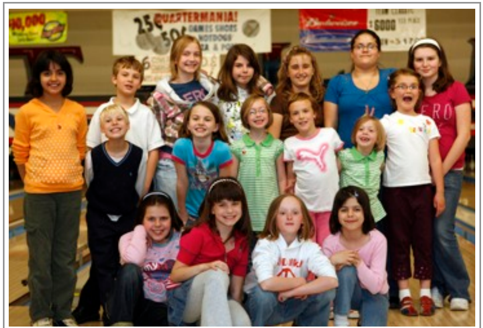
Christ Kids Bowling Party